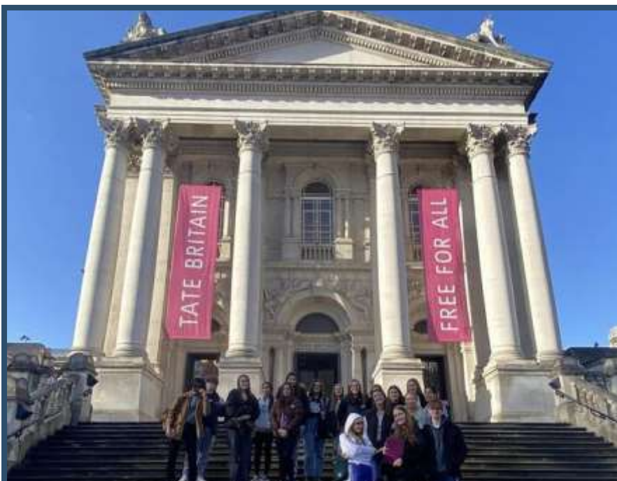
Sixth Form - London