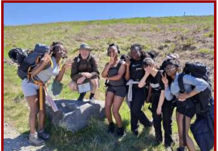
Duke of Edinburgh