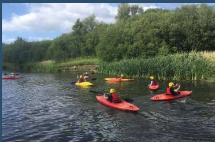
Year 8 Activity Trip

At Cardinal Langley, there are a wide range of learning opportunities and enrichment activities that take place outside the classroom. Here are just some examples of previous trips and activities: