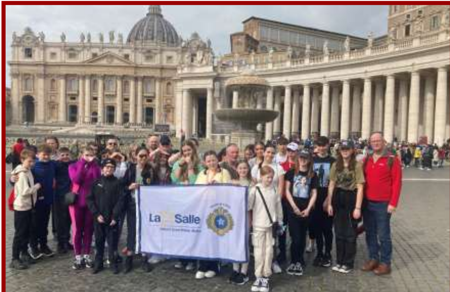
Rome - Anniversary Visit