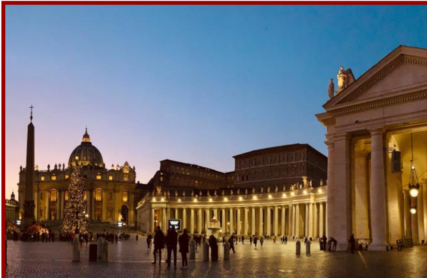
Rome - Anniversary Visit