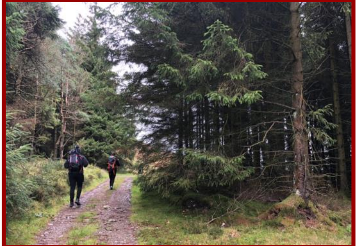
Duke of Edinburgh