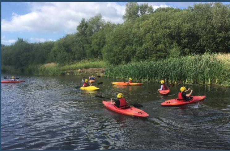
Year 8 Activity Trip