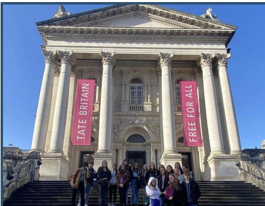
Sixth Form - London