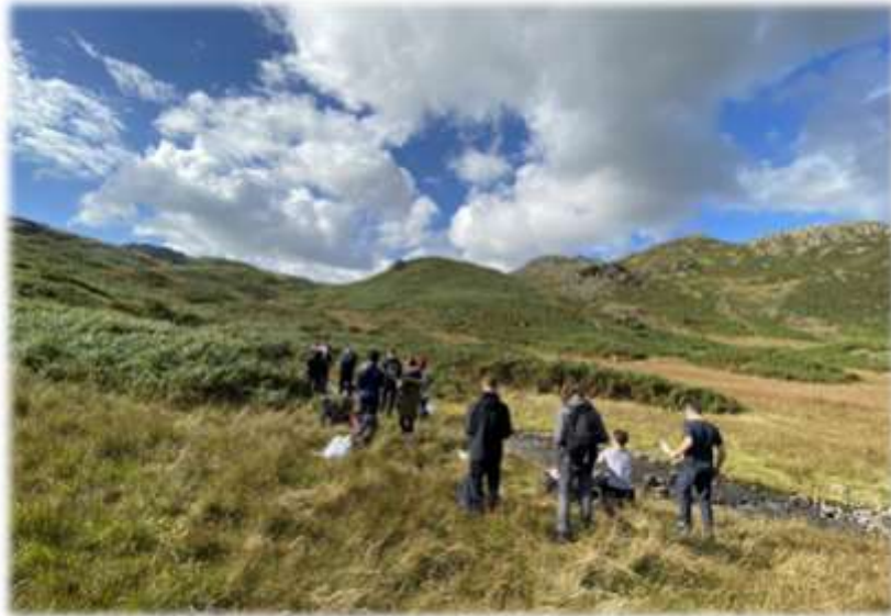
Year 11 students collecting data on the banks of Sourmilk Ghyll, a tributary of Easedale Beck near Grasmere

In September and October of this year, the Geography Department took their Year 11 students to the Lake District on two different field trips . The trips were designed to develop the students' fieldwork skills and prepare them for an element of the GCSE Geography exam in the summer. In class, students study units entitled 'Physical Landscapes of the UK' and 'The Changing Economic World' and the trips gave them the opportunity to investigate whether the theories they learn about in class can be observed in the real world. Visiting Grasmere, students worked in and around the Easedale Beck river system to investigate how river processes change downstream from the source to the mouth. A few weeks later, their visit to Bowness on Windermere allowed students to collect data relating to the town's demographics and how they are impacted upon by the thriving tourism industry .