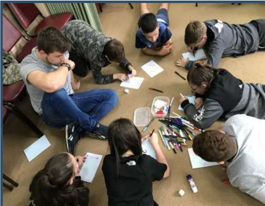
Savio House - Year 7 Retreat