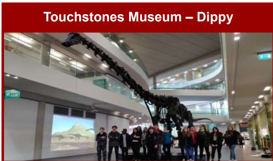
Touchstones Museum – Dippy