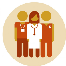
Issue #1 Staffing

To explore what it is like to work in the Health & Social Care sector including the roles & responsibilities of workers and organisations