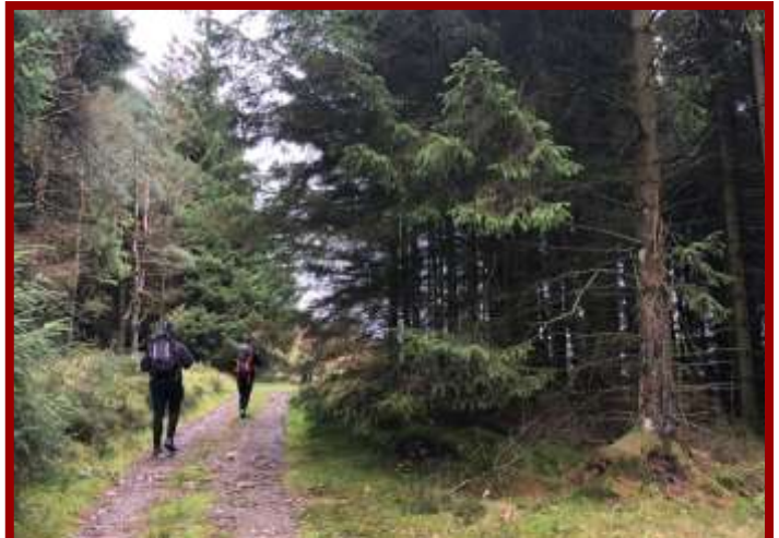
Duke of Edinburgh