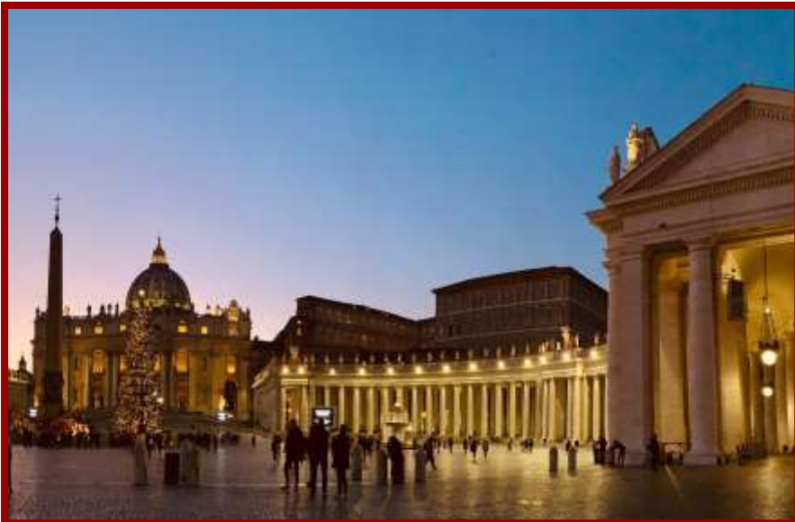
Rome - Anniversary Visit