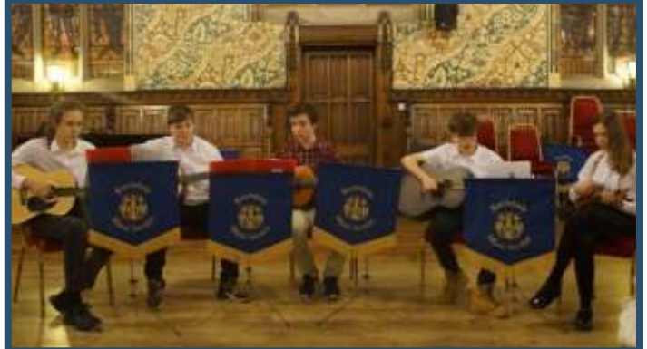
Shakespeare Schools Festival