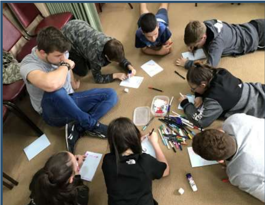
Savio House - Year 7 Retreat